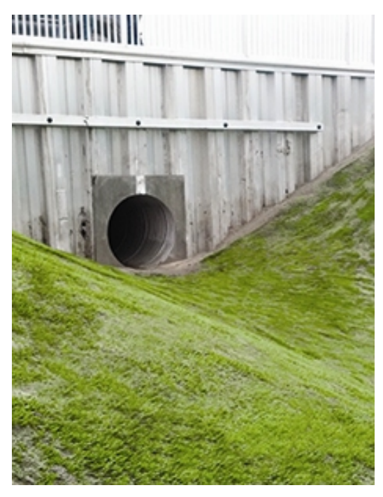
Figure 6.1.—HydroTurf™ Outfall Structure with St. Johns River Water Management District in Florida.